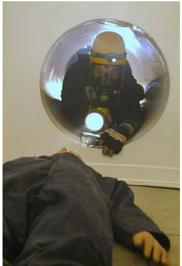
ACUTE's new confined space entry simulator in use

Please drop by and see our new equipment.